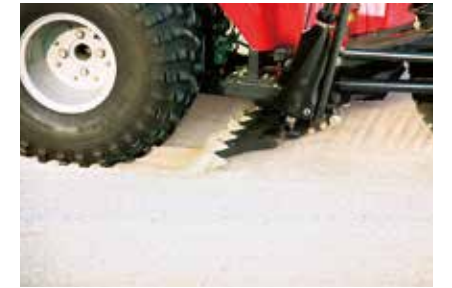
The cultivator option breaks up and softens coarse sand.