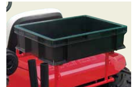
The cargo box option allows operator to carry cooler, walkie-talkie and other necessary tools.