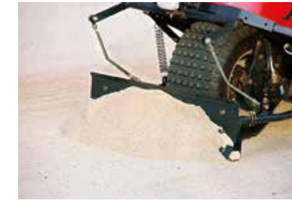
The front blade option smooths and evens the bunker.