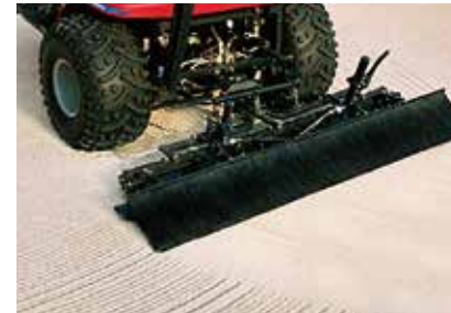
The Brush option beautifully finishes the bunker surface.