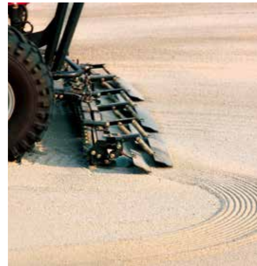
*The model shown is equipped with optional features.

※ The factory default maximum engine rpm is 3,100 rpm.