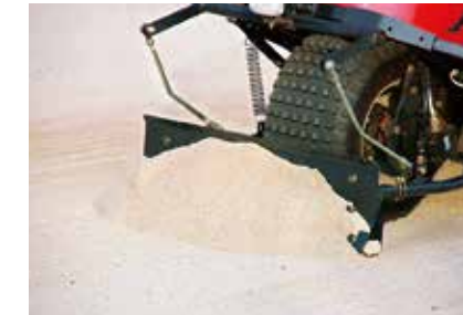
The front blade option smoothes and evens the bunker.